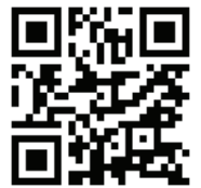
All Wave Nodes

In over 1000 leading Carrier Neutral Data Centers in the United States, Canada, and Mexico. See full list of locations →